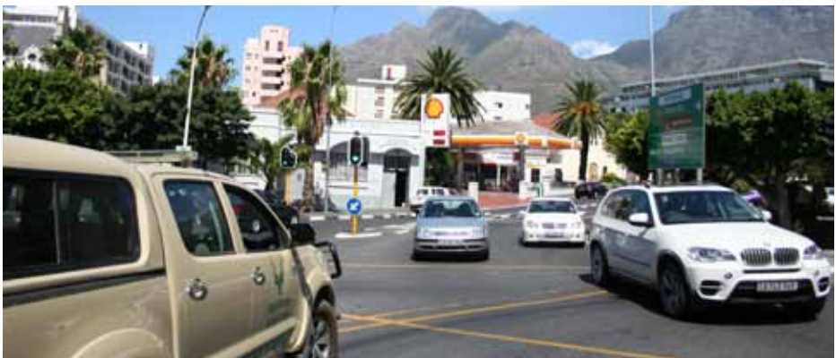
Construction is planned from August and will involve significant traffic disruption.

For more information call Craig Bowker on 082 468 2410.